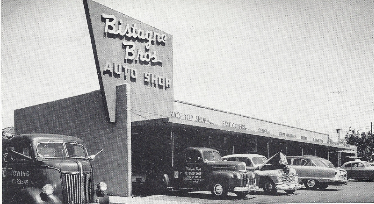
Modern, efficient, profitable—that's the story behind this shop in Glendale, Calif.

in Glendale, across the street from where we are now. We had one helper. We worked hard and turned out darn good jobs. The result was that in 1949 we were able to move over on this side of the street where we had a building built for us with almost four times as much undercover space. Hard work and good work seems to pay off, since today we have 14 great guys working for us, turning out 19 complete jobs and about 80 spot jobs per week. We get almost all of our jobs through word-of-mouth advertising by satisfied customers—only one out of seven jobs is an insurance job. When you look at the pictures on these pages you can see that we're awfully strong on the Acme line. We've come a long way with it. One thing we particularly like about it is that the line is always up to date. As soon as there's a new problem that